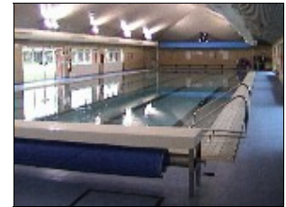
Middleton Pool at Newport Pagnell

Middleton Pool, Newport Pagnell Stantonbury Campus leisure centre Wolverton Polo (seasonal) Woughton Leisure Centre Bletchley Centre Leon School Pool, Bletchley