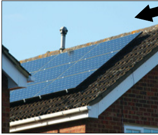
A 2.5 kW peak Solar PV system